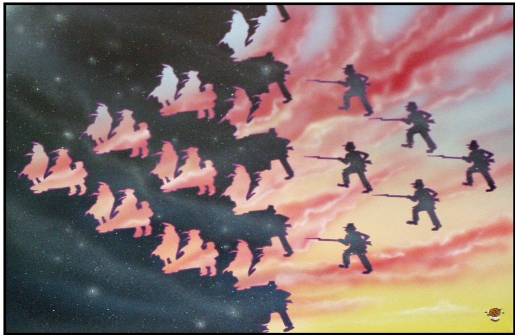
"THE NIGHT THE LIGHTS WENT OUT IN GEORGIA"