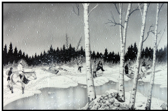
"LAST TO LEAVE"