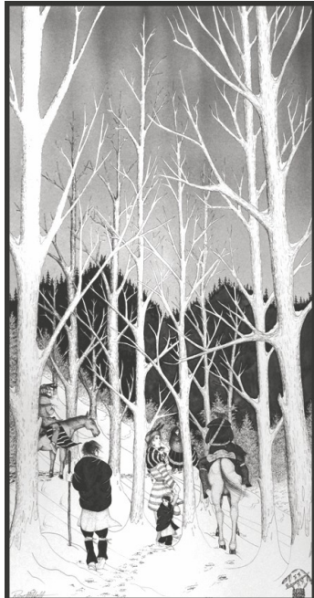
"TO A DISTANT WILDERNESS"